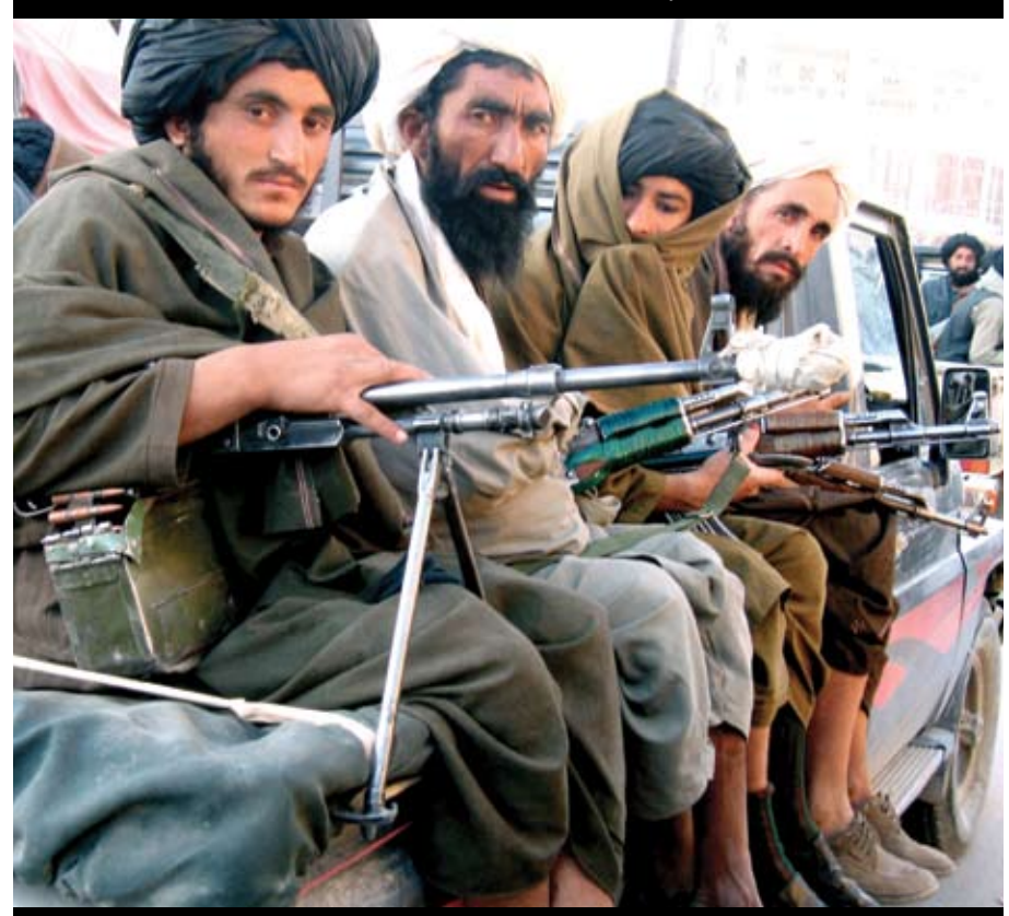
How long can international coalitions fight to stabilize an unstable nation?

HROUGH SPEECHES, interviews and press conferences, American political figures describe the "unjust," "unfounded" and "immoral" Iraq war. But in the same breath they praise the "well-intentioned" and "necessary" war in Afghanistan.