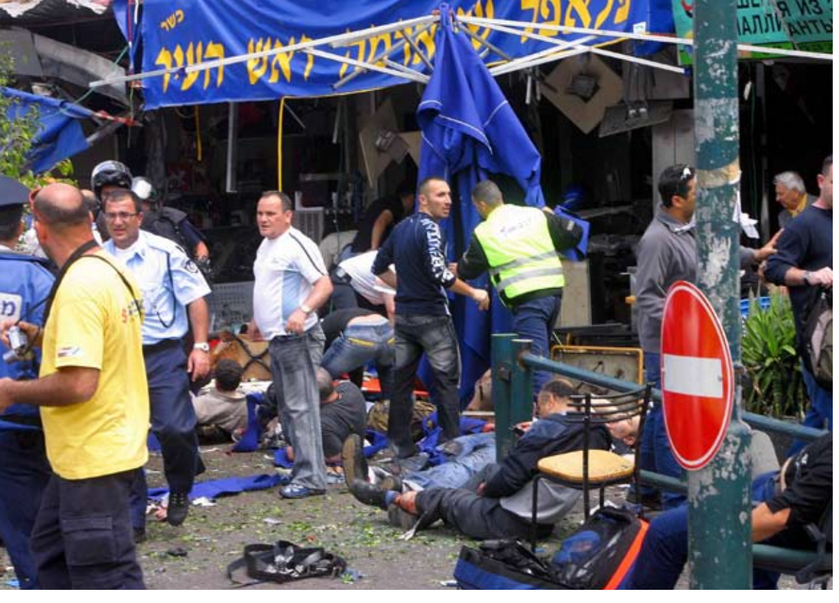
■ ONGOING SUICIDE ATTACKS: A Palestinian suicide bomber blew himself up outside a fast-food restaurant in Tel Aviv during the Passover holiday, April 2006, killing nine other people and wounding dozens in the deadliest Palestinian attack in more than a year.

have been reduced to nearly zero. This is leading some to believe that a clear division is the best way to begin anew.